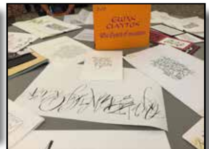
Work from Ewan Clayton's class