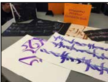
Work from Massimo Polello's class