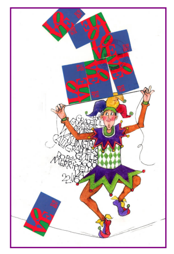
Ruth Korch - 2006