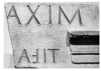
The inverted F was pronounced like a W/V to differentiate it from the vocalic U sound.

* One of your editor's stops in Rome was at the Epigraphic Museum, part of the National Roman Museum at the Baths of Diocletian. The items are carefully selected from their collection of 10,000 inscriptions to give a walk through Roman inscriptions from scratches on pottery to informal wax tablets to some majestic Roman caps, with enough enlightening didactic material along the way to keep non-calligraphers from bolting. I was particularly intrigued by this inscription; the inverted F looked like drunken stonecutting but turned out to be one of three letters that the emperor Claudius introduced to make spelling more clear. It had the consonant sound of W/V; the letter V sounded 'oo'. Some experts think that the upside down F