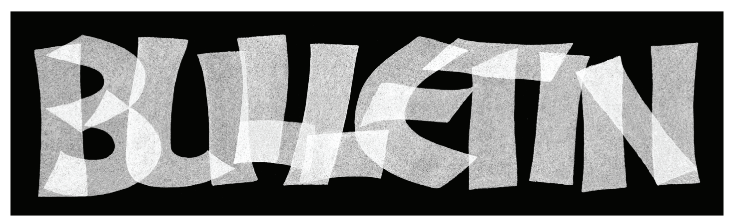
Number 122 • March 2016