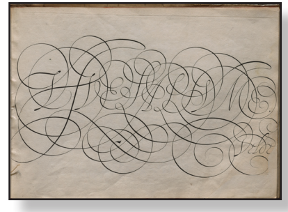
Jan van den Velde, Spieghel der Schrijfkonste 9 x 12 5/8", Amsterdam, 1605, Engraved Calligraphy Printed by Intaglio