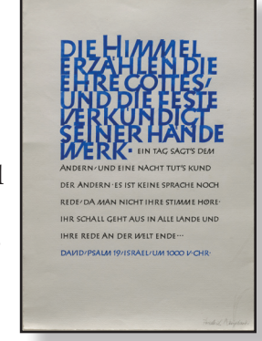
Friedrich Neugebauer, Psalm 19, 15 1/2 x 10 1/2" Austria, 1959, Pen & Ink on Paper

Follow Letterform Archive on Instagram (@letterformarchive) and Twitter (@lett_arc) for a regular stream of appealing images. Notifications of upcoming events are posted at letterformarchive.org/news, where members may also sign up for the Archive's email list. For information on Type@ Cooper West, an educational program of public lectures and workshops offered in conjunction with The Cooper Union, please see www.coopertype.org.