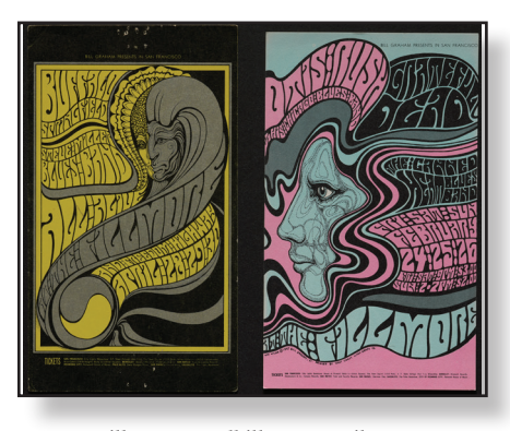
Fillmore Handbills: Wes Wilson, Fillmore Auditorium Handbills, 7 3/4 x 4 1/2" & 8 x 4 1/2" San Francisco, 1967, Lettering Reproduced by Offset Lithography