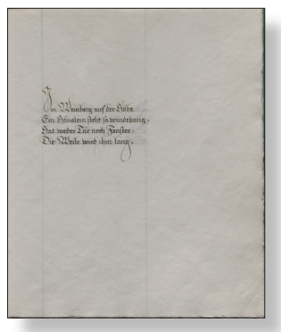
Koch Manuscript: Rudolf Koch, Der Knabe und das Immlein, 7 5/8 x 12 1/2" Poem by Eduard Mörike Ofenbach, 1912, Calligraphic Manuscript on Paper