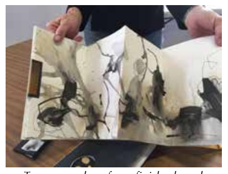
Two examples of our finished work