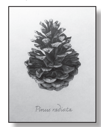
Betsy's beautiful hand-sketched 'Pine Cone' with amazing detail

A Remembrance will be held at 11 AM on Monday, October 9 at Fernwood Cemetery, 301 Tennessee Valley Road, Mill Valley.