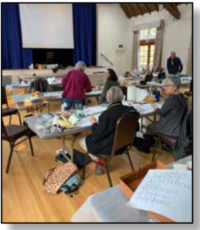
Participants in Joke's Workshop