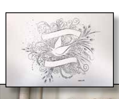
Ellen Bauch creating her colorful pattern!