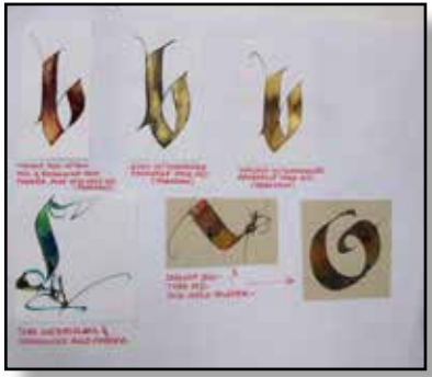
Julie's demo on adding metallic powders to wet ink — walnut ink here.