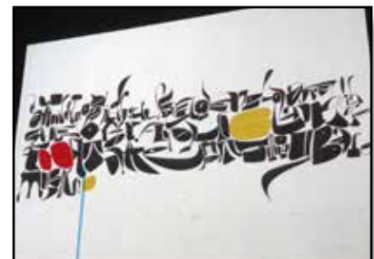
Another example of Brody's Submarine hand.