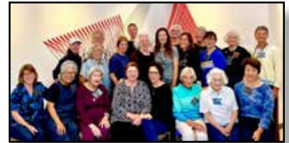
What a great group!